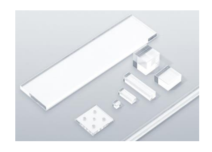
LFS Scintillation Crystals