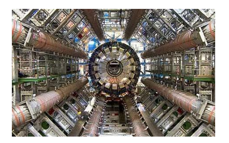
Components for PET Medical Scanners & the Large Hadron Collider