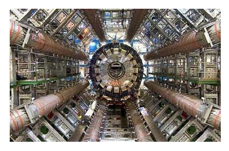
Components for PET Medical Scanners & the Large Hadron Collider