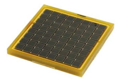
Detector and Scintillator Arrays for PET