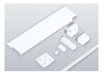
LFS Scintillation Crystals